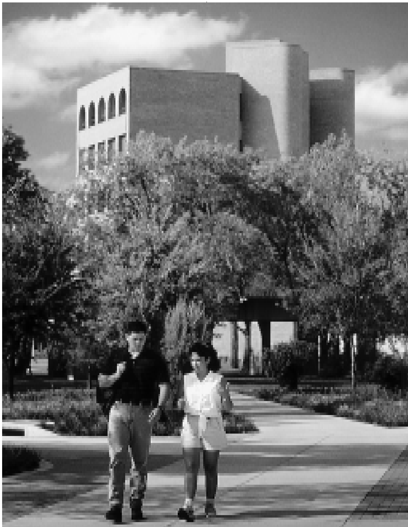
The University of Texas-Pan American